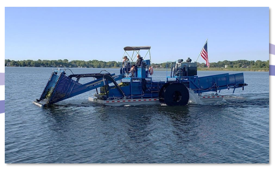
Harvesting operations began the week of June 21st and will continue through the end of August.

Before the meeting, the new weed harvester will be available for viewing in the parking lot at 5:30pm. There will be a brief ceremony at 6pm, followed immediately by a group picture of all present. This is your chance to see the harvester and trailer up close! Even with the low lake levels this summer, her inaugural year has been a huge success. Come celebrate with her crew and be a part of history!