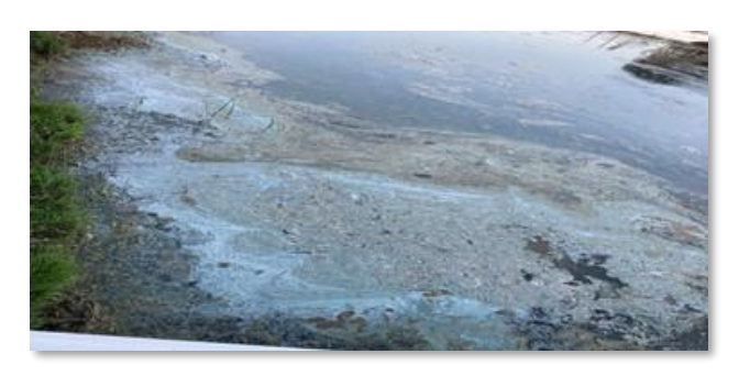
Blue Algae