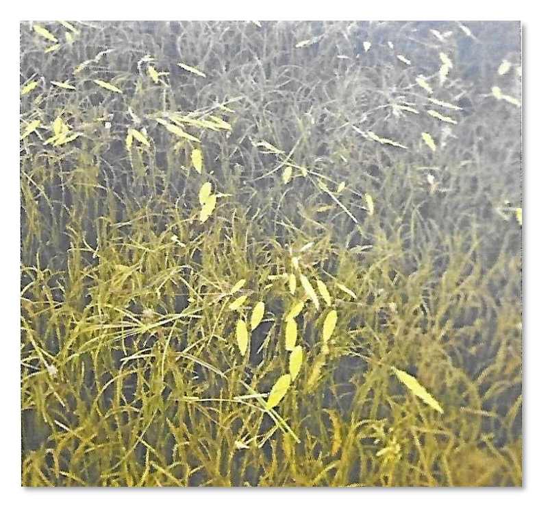
Good: Wild Celery and Pond Weeds

Good weeds, in general, are less dense, have a thinner architecture, and often can be boated through. Native weed beds are great for the fisheries. Invasive species weed beds are generally very dense and can quickly block boat traffic. Dense, monotypic stands of invasives negatively affect the fisheries.