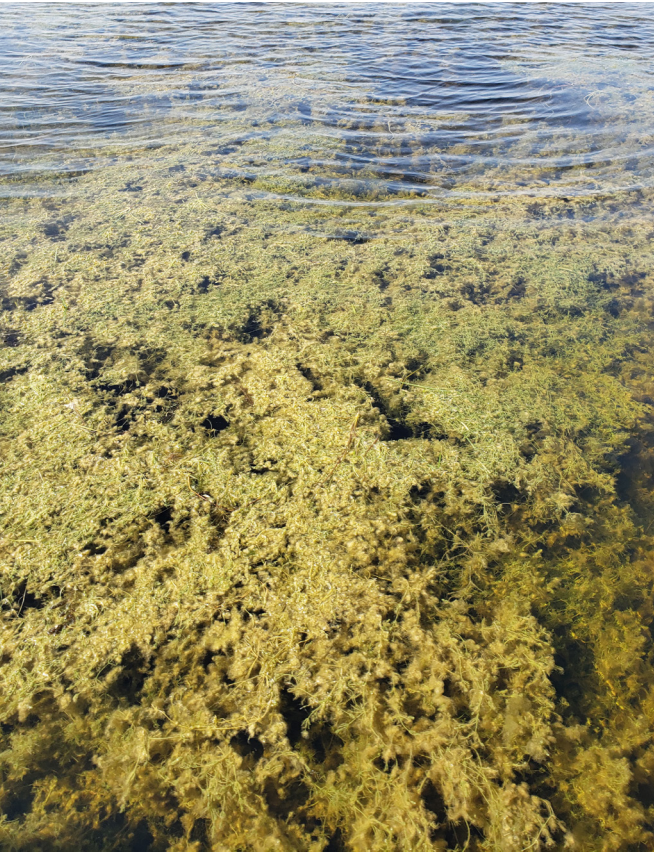
Bad: Starry Stonewort and Filamentous Algae Photo taken 7-27-19 on NW shoreline 4 feet deep