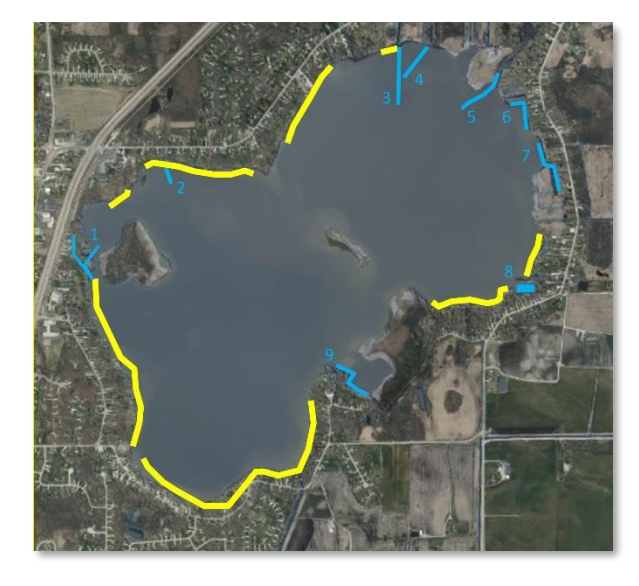
2021 Proposed Chemical Treatment Areas

Commissioner's meetings are usually held the 4<sup>th</sup> Monday of every month, with the November and December meeting combined. Meetings begin at 7pm at the Norway Town Hall. All residents are welcome to attend, but please note that meeting dates are subject to change. Always refer to our website for the latest up-to-date information.